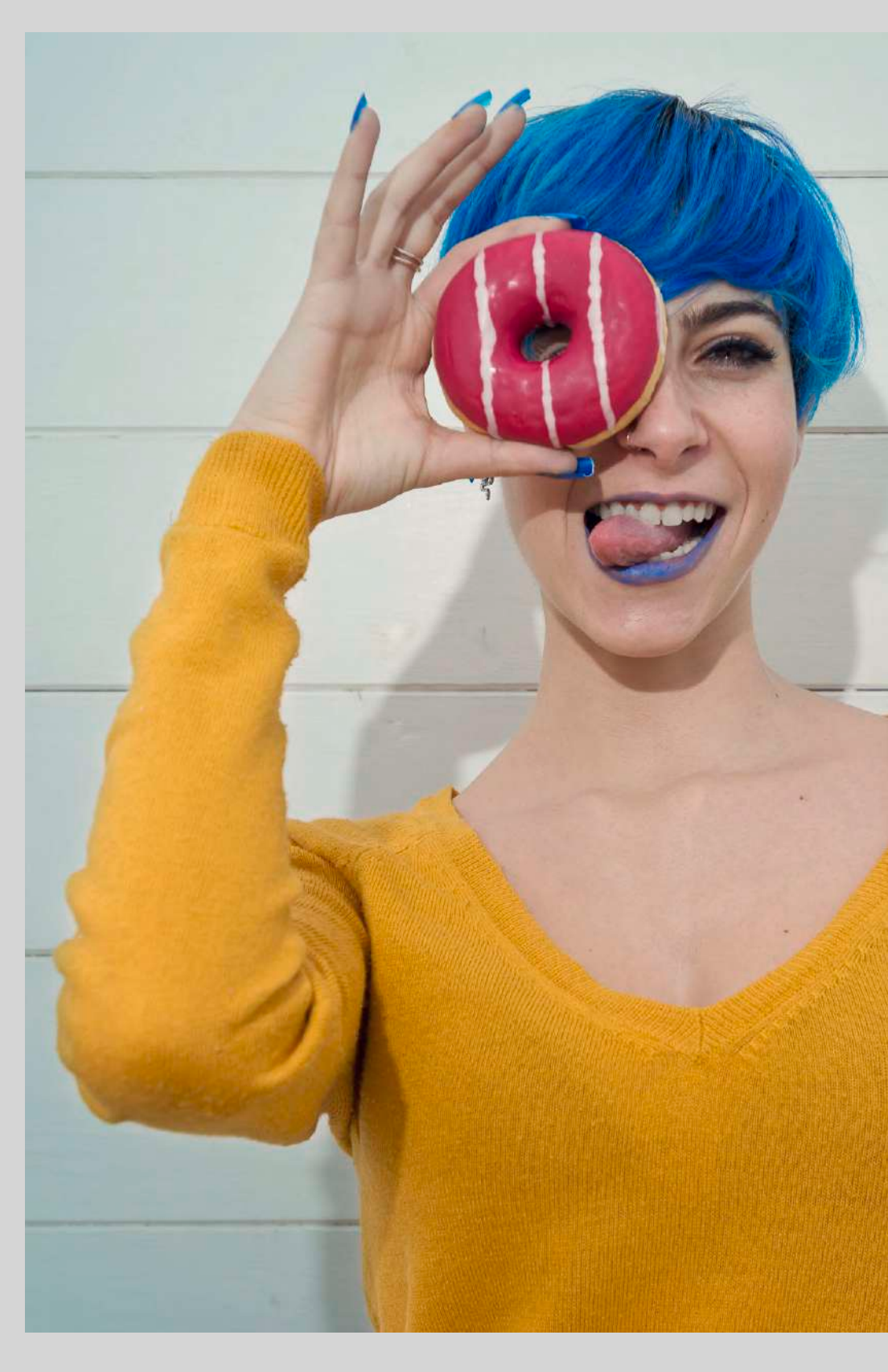
Why the UK ban on high-fat, high-sugar food ads can reshape our bodies and our brands