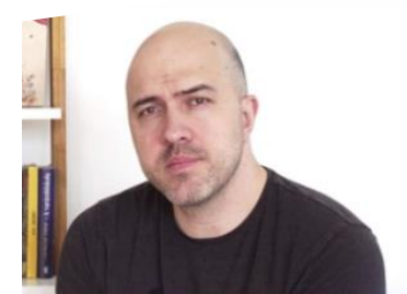
SZABÓ SIMON Színész

In a category dominated by the all-powerful digital players, the team in Hungary created an online retail presence that felt personal, compelling and totally authentic. They encouraged local writers, artists, musicians and journalists to photograph their own bookshelves and post them on social media. They then made them shoppable and placed them on the shop site and across digital channels. A wonderful idea which resulted in a sales increase of 910%.