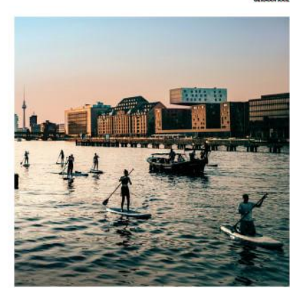
Berlin, Germany: 19 Euro