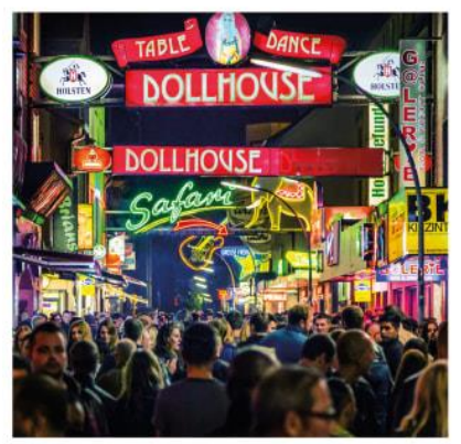
St. Pauli, Germany: 19 Euros