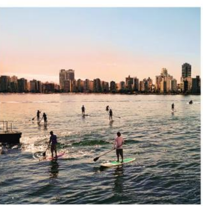
Santos, Brazil: 1.154 Euro