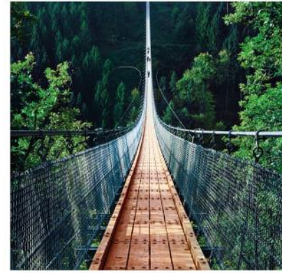
Hunsrueck, Germany: 19 Eur